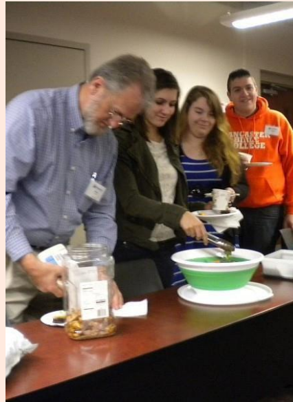
Students enjoy snacks at break time.

Bring this registration form and any payment to class with you on August 19 th .